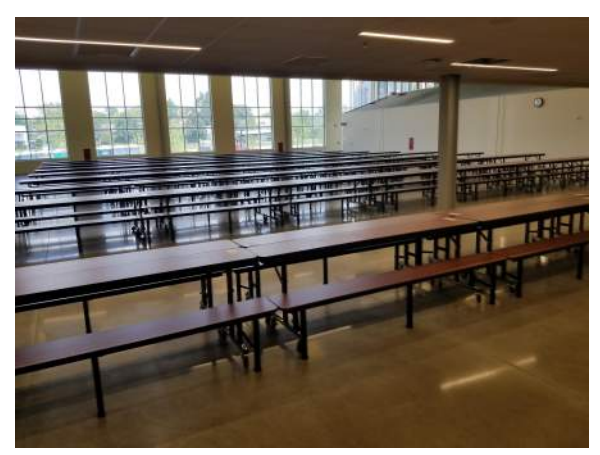
Dinning Commons Furniture