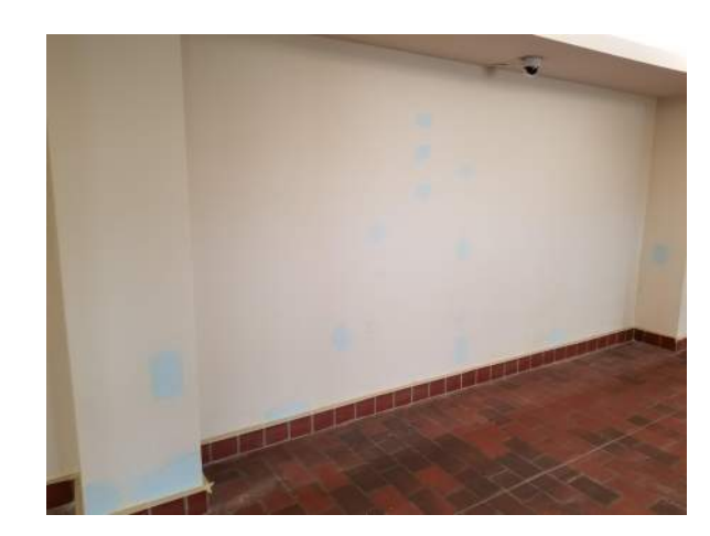
Wall Repairs Throughout Building