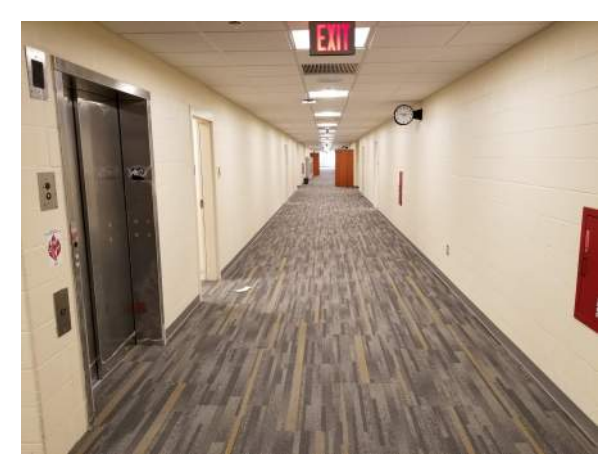
Cedar Level North Corridor Carpet